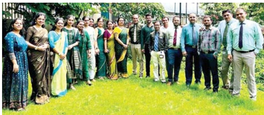
Staff of Kokilaben Dhirubhai Ambani Hospital, Navi Mumbai celebrate 5th day of Navratri with enthusiasm