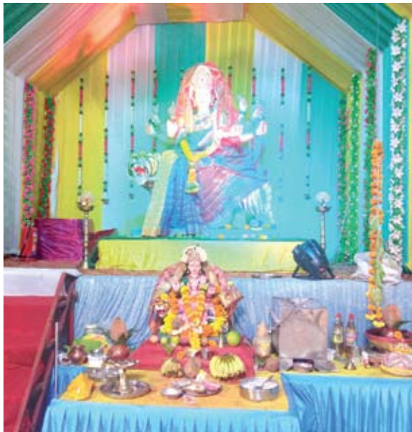
A glimpse of Durga Mata idol of Ashok Patil Mitra Mandal and Jai Bhawani Mitra Mandal at Sector 15, Airoli