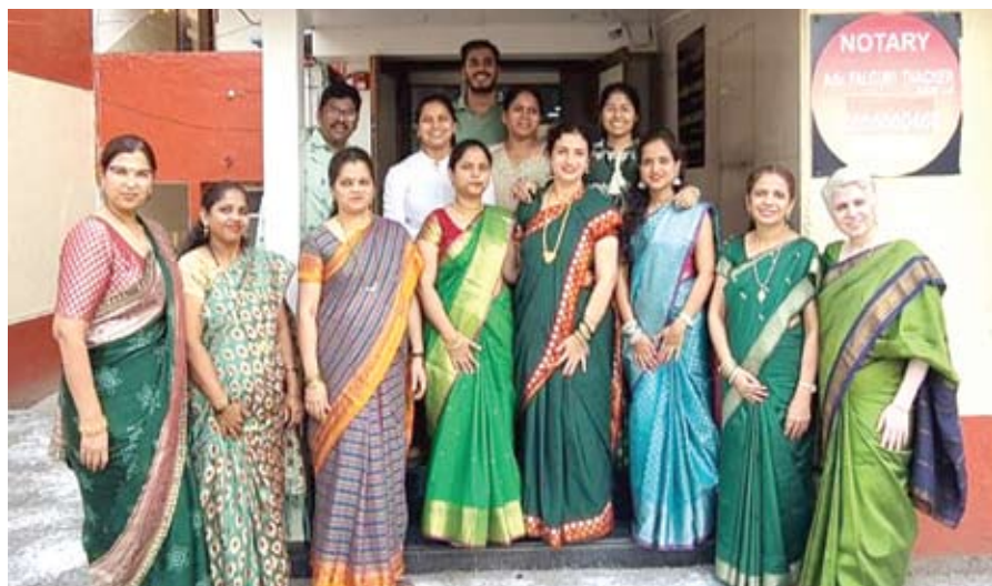
On the 5th day of Navratri, the staff of M.T. Thacker & Associates adorned themselves in green attire in keeping with the theme of the nine Navratri colours.